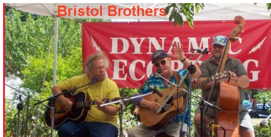
The Bristol Brothers

We cannot let this proposal go unchallenged!